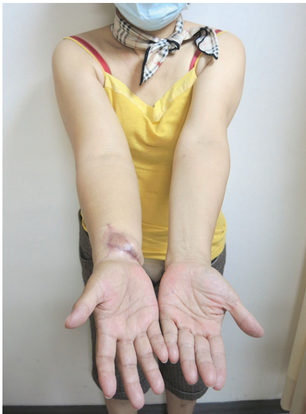
Figure 2 Nine-month postoperative picture after delayed skin grafting for lymph node flap transfer (LNFT). Delayed split skin grafting allows reduced graft requirement, leading to better aesthetic outcome. Further improvement can be achieved by scar revision after 1 year of primary surgery.

of the skin graft is avoided. Fortunately, in our study, we did not encounter such a scenario. Another interesting benefit is the avoidance of any issues arising out of ex vivo storage, which may not comply with the strict norms laid down for skin and tissue preservation by various regulatory authorities. It eliminates potential complications like clerical errors, contamination and wrong patient graft application, which may occur in scenarios where the graft is stored ex vivo in the hospital's skin banks. An additional advantage derived from this method is the cost effectiveness. The primary procedure is shortened by reducing the time required in graft inset and the delicate graft dressing. Moreover, the delayed procedure can be easily managed at the bedside in simple analgesia cover, thus avoiding the operation theatre and anaesthesia expenses. The analgesia requirement for the skin graft donor site is reduced as the graft itself acts as a biological dressing. Some patients may, however, be uncomfortable to have an additional procedure, especially when performed without complete anaesthesia. Yet, we firmly believe that this combined technique is largely comfortable and safe for most of the patients and allows flexibility in the coverage of the donor site while providing additional security against tension and compression of the flap pedicle in the critical early postoperative period.