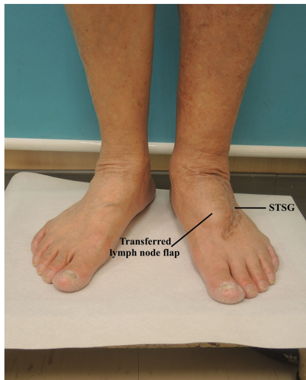
Figure 3 Eight month follow-up picture shows a satisfactory result following lymph node flap transfer (LNFT) and delayed split thickness skin grafts (STSG) to the dorsum of the foot in case of lower extremity lymphoedema.

of the skin graft is avoided. Fortunately, in our study, we did not encounter such a scenario. Another interesting benefit is the avoidance of any issues arising out of ex vivo storage, which may not comply with the strict norms laid down for skin and tissue preservation by various regulatory authorities. It eliminates potential complications like clerical errors, contamination and wrong patient graft application, which may occur in scenarios where the graft is stored ex vivo in the hospital's skin banks. An additional advantage derived from this method is the cost effectiveness. The primary procedure is shortened by reducing the time required in graft inset and the delicate graft dressing. Moreover, the delayed procedure can be easily managed at the bedside in simple analgesia cover, thus avoiding the operation theatre and anaesthesia expenses. The analgesia requirement for the skin graft donor site is reduced as the graft itself acts as a biological dressing. Some patients may, however, be uncomfortable to have an additional procedure, especially when performed without complete anaesthesia. Yet, we firmly believe that this combined technique is largely comfortable and safe for most of the patients and allows flexibility in the coverage of the donor site while providing additional security against tension and compression of the flap pedicle in the critical early postoperative period.